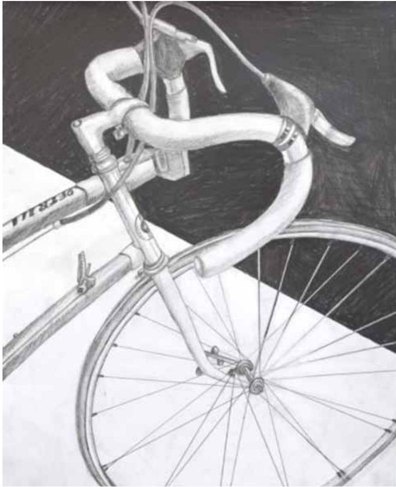
"Observation Bike Study" by Miao Liu, The Tatnall School, Grade 12